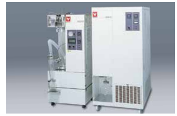
Example of installation: ADL311SA + GAS410